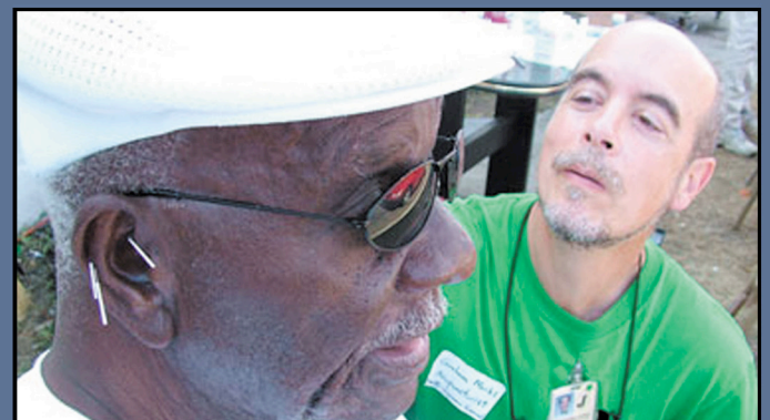
AWB volunteers provided free community acupuncture treatments to residents, relief workers and first responders in New Orleans.